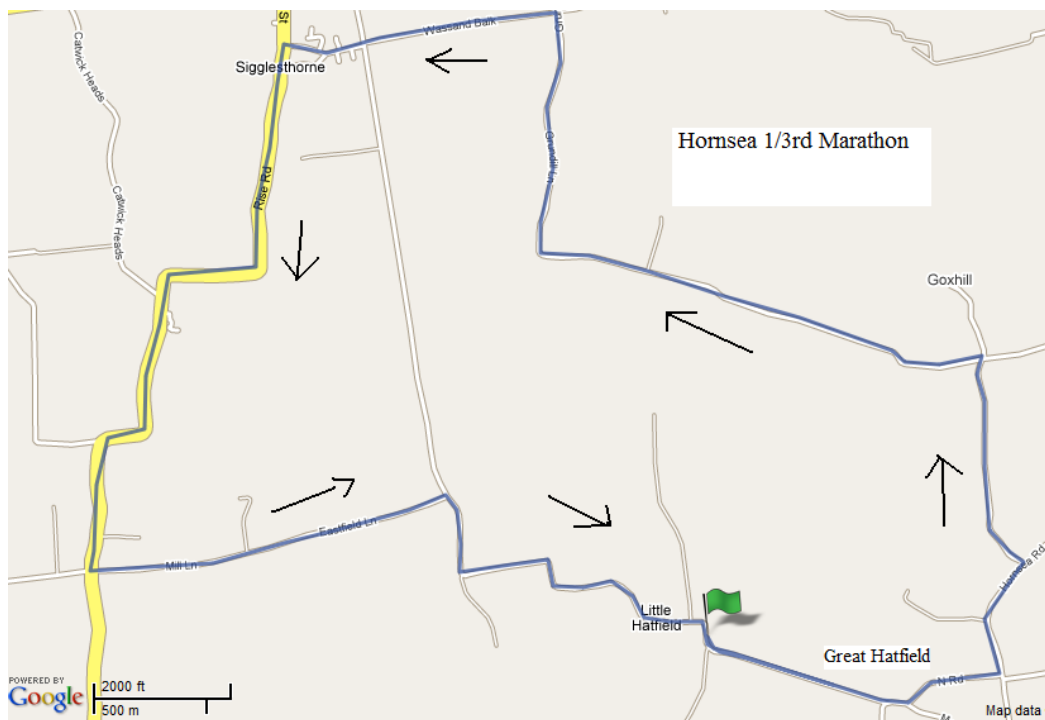
Direction of Running Hornsea 1/3 rd Marathon

https://www.yell.com/biz/densholme-care-farm-hull-8147042/#view=map