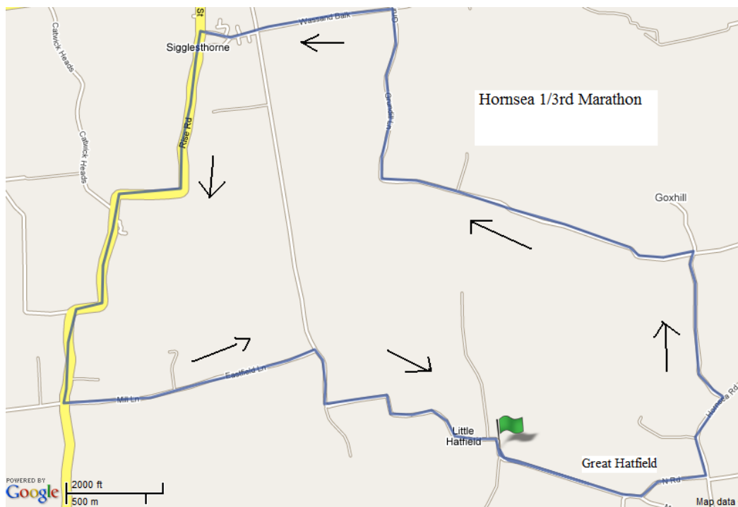
Direction of Running Hornsea 1/3 rd Marathon

https://www.yell.com/biz/densholme-care-farm-hull-8147042/#view=map